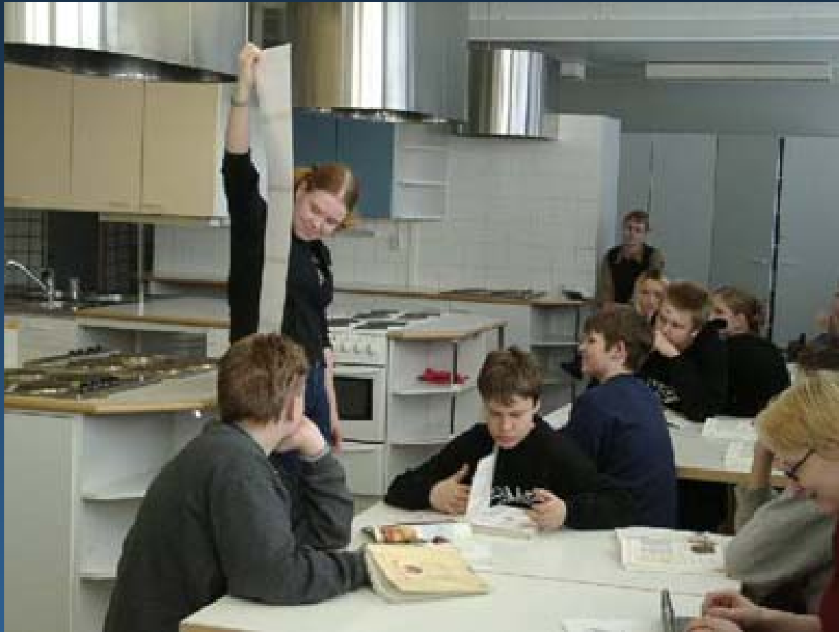
Example picture taken during a lesson