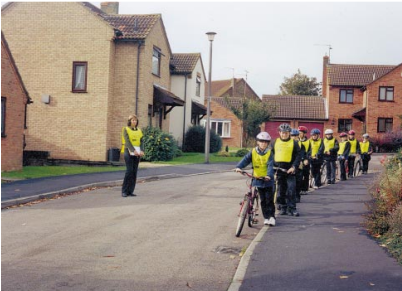
Safer cycling training with Cambridgeshire County Council's Road Safety section