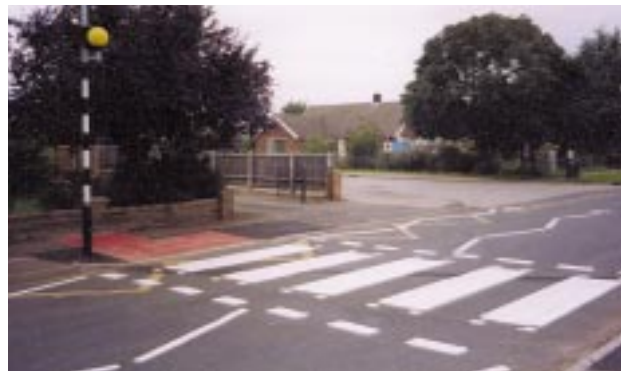
A new Zebra Crossing helps make getting to school in Somersham safer