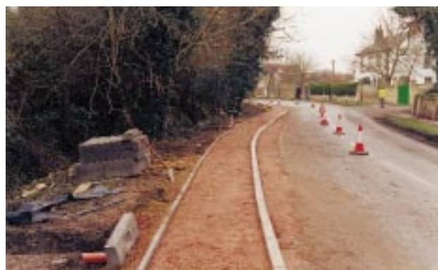
Construction of a new footpath in Meldreth