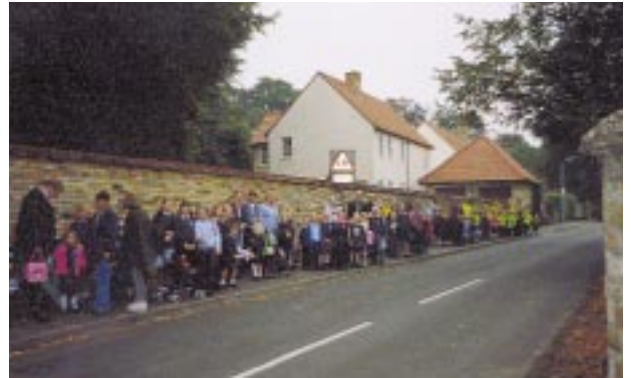
Healthy choices: pupils from XXXXXXXXXXXX School take part in National Walk-To-School Week

Schools will be able to gain special contacts with other agencies, such as Health, Environment, Road Safety Education, Traffic Management and Highways Engineers. Schools will receive all necessary assistance in mounting exhibitions and staging public consultations. Cambridgeshire County Council is able to provide funding for physical measures, where appropriate.