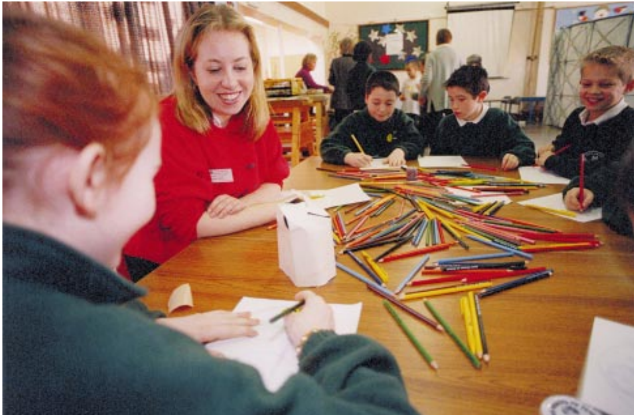
Making safety cool: children design their own cycle helmets

Note: Submitting an application is no guarantee of being accepted on to the project.