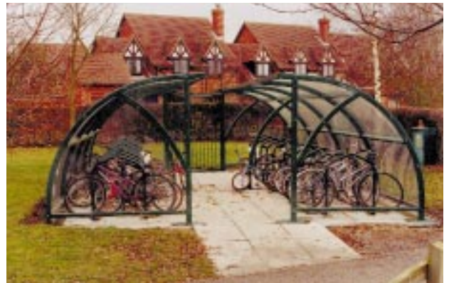
Cycle storage provided by Safer Routes to School