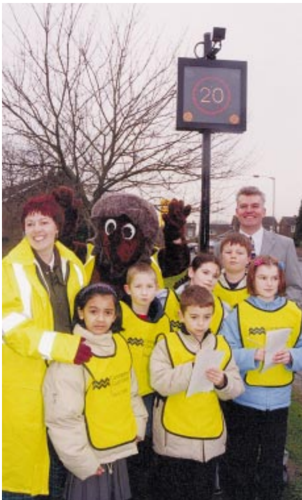
Introduction of a speed reduction scheme in St Ives

We already have the postcode data showing travel modes at your school from our annual monitoring process. This data will be added to your application on receipt.