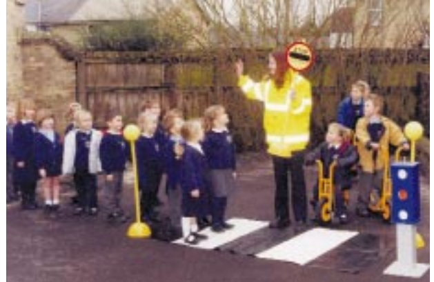
Starting early: primary school children learn road craft skills

Safer Routes to School Project Team Stanton House Stanton Way Huntingdon Cambridgeshire PE29 6XL