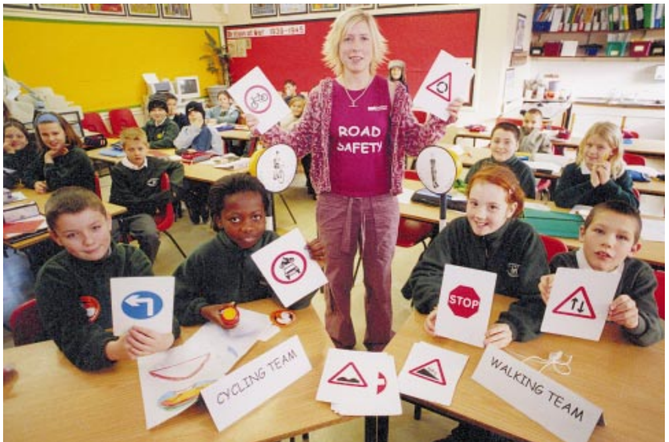
SRTS/CCC provide training to pupils on a Road Safety Day at Meldreth Primary School ????? or something like that?