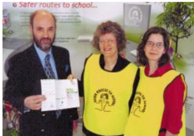
Commitment from Girton Glebe School as they produce their Travel Plan